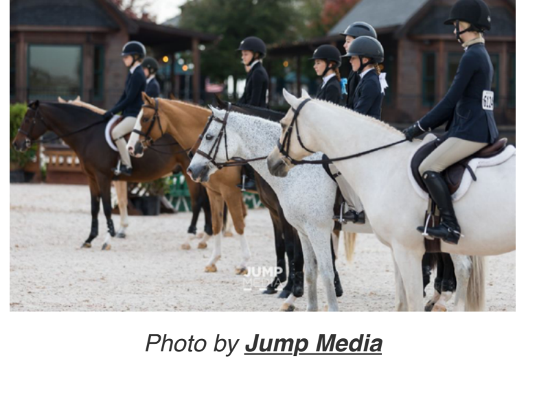
In the hunter and jumper rings, catch riding is a common occurrence. A catch

Briefly: A Look Back at Leone Equestrian Law Articles